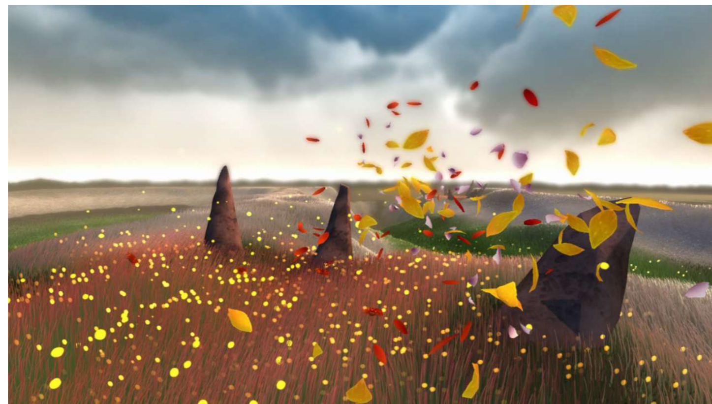
Figure 1. Thatgamecompany. PlayStation 3. (2009), Flower.