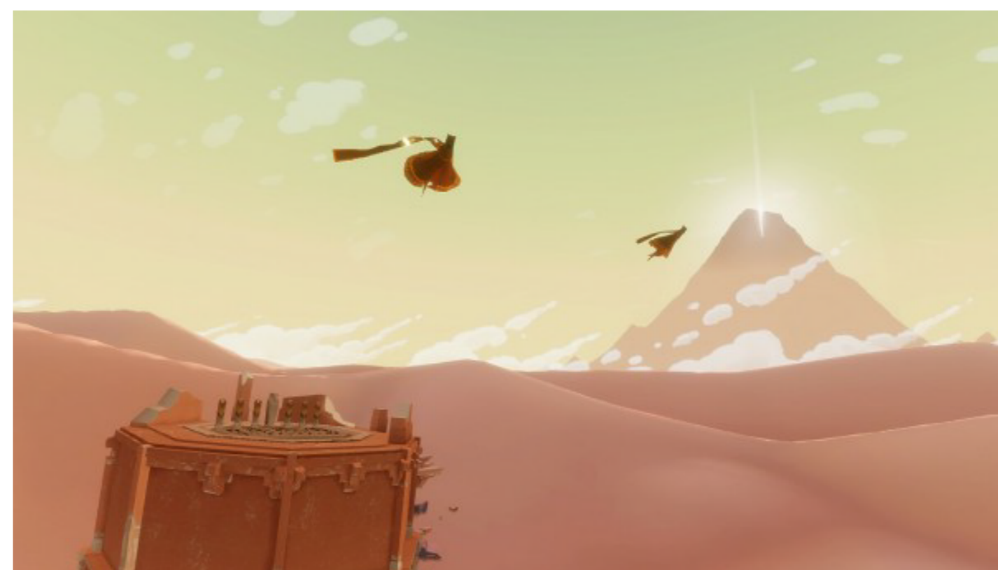
Figure 3. Thatgamecompany. PlayStation 3. (2012), Journey.